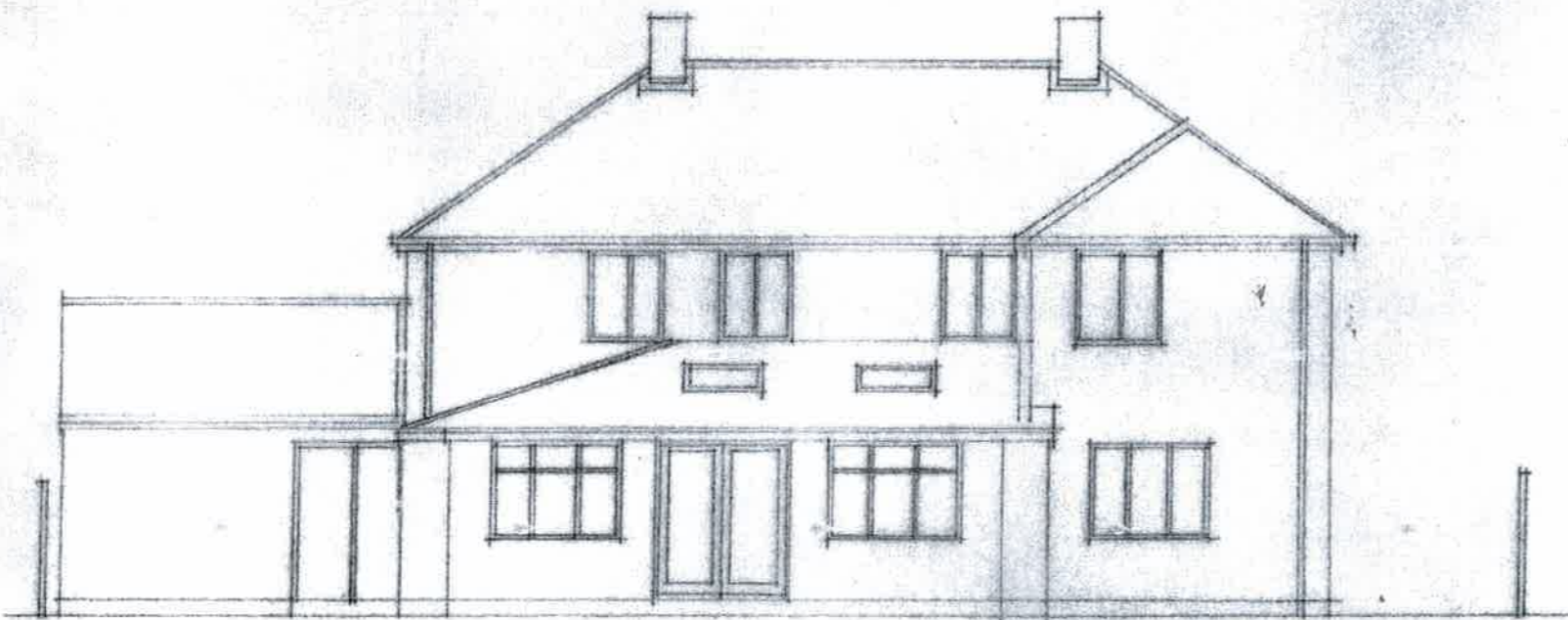
REAR ELEVATION AS EXISTING 1:100